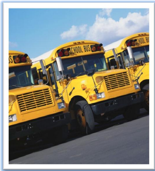
Keeping our Students Safe

Safety is a priority for the Western School District. We ask parents/guardians, students, bus drivers, and the public to take care and caution, especially when driving in school zones.